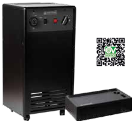
PURIFIERS + IONISERS