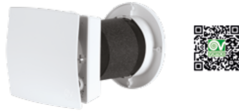
DECENTRALISED HEAT RECOVERY UNITS

VORTICE VARIO Range is composed of fan extractors able to exchange the air. They introduce clean air from the outside into the premises and extract the polluted air, ensuring our safety and health.