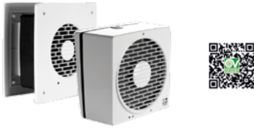
AXIAL FANS FOR WALL/GLASS INSTALLATION