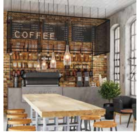
Restaurants, bars and canteens