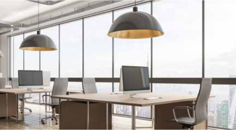
Offices, meeting rooms and professional studios