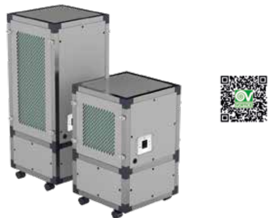
DEPURO PRO AIR PURIFIERS WITH HEPA H14 FILTERS

They are able to eliminate up to 98% of the pathogens in the air, such as pollen and microparticles, which are potential carriers of viruses and bacteria.