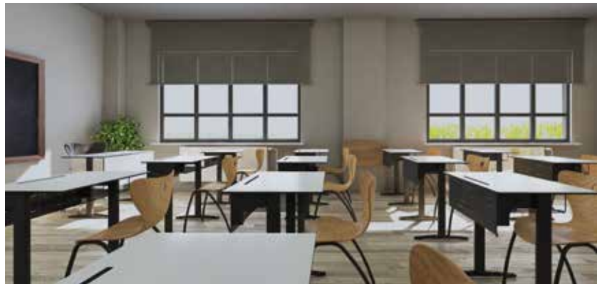
Universities, schools and kindergartens